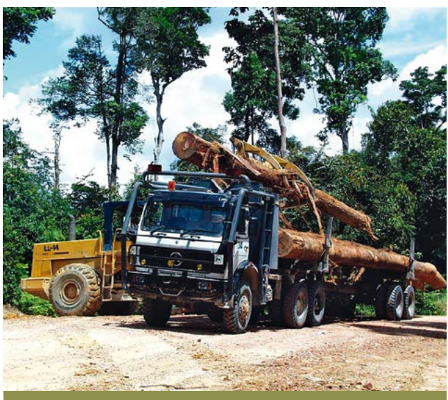
Log loader in Indonesia.

In 2003, the Indonesian government appeared, on paper, to step up its efforts by completing a draft TLAS, formally known by its Indonesian name, Sistem Verifikasi Legalitas Kayu (SVLK). However, four years later, drafting was still not complete, leading many non-governmental organizations and international agencies to question Indonesia's resolve to follow through on its commitments. Yet by late 2007, draft legislation was submitted by the Indonesian negotiators to the Ministry of Forests for approval, and, in 2009 the SVLK was signed into law. In a departure from previous efforts that were criticized as limited, independent third parties were charged with auditing compliance with Indonesian law (Luttrell et al., 2011). In addition, civil society is empowered to provide independent monitoring and to submit objections. In sum, the case of Indonesia displays a progression from no support in 1999, to weak support in 2001, to formal and legislated commitments in 2009, followed by increasing support since this time. This ongoing support was matched by increasing roles for stakeholder groups to participate in standard development processes. Civil society representatives were successful in championing good forest governance, transparency and accountability, as well as supporting third party auditing and independent monitor-