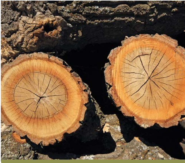
Mahogany wood. Trading mahogany species is restricted by the Convention on International Trade in Endangered Species of Wild Flora and Fauna (CITES).

One of the most challenging tasks facing development agencies, trade ministries, environmental groups, social activists and forest-focused business interests seeking to ameliorate illegal logging and related timber trade is to identify and nurture promising global governance interventions capable of helping improve compliance to governmental policies and laws at national, subnational and local levels. This question is especially acute for developing countries constrained by capacity challenges and "weak states" (Risse, 2011). This chapter seeks to shed light on this task by asking four related questions: How do we