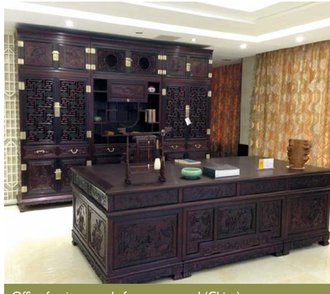
Office furniture made from rosewood (China)

Given that individual countries decided whether, and how, to implement the EUTR, it is also important to note divergent uptake/implementation within Member countries (Sotirov et al., 2015). In general, scholars have found weak implementation within poorer Eastern European countries such as Bulgaria and Romania (Gavrilut et al., 2015) as well as in Southern Europe, particularly in Greece, Italy and Spain (Sotirov et al., 2015). Other scholars have found increasing coordination between EUTR implementation and FLEGT VPA processes, owing for example to the creation of the European Commission's EUTR/FLEGT Expert Group, an informal enforcement network convened by EU Member State Competent Authorities, and the Timber Regulation Enforcement Exchange (TREE) network organized by Forest Trends, which brings together environmental